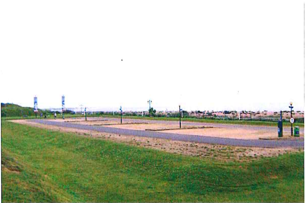
Main car park