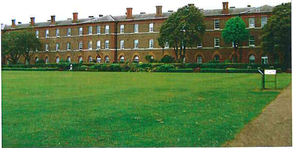
Gunners Row – south elevation