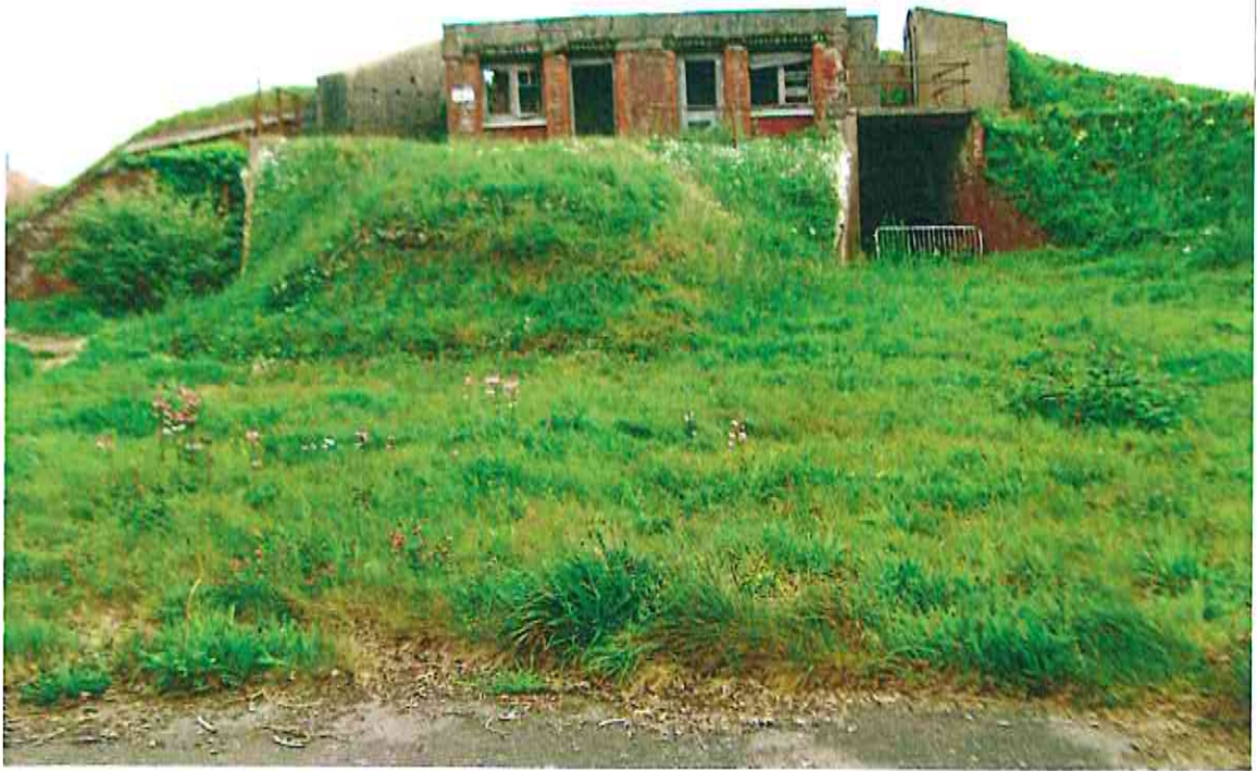
Eastney Fort East (part)