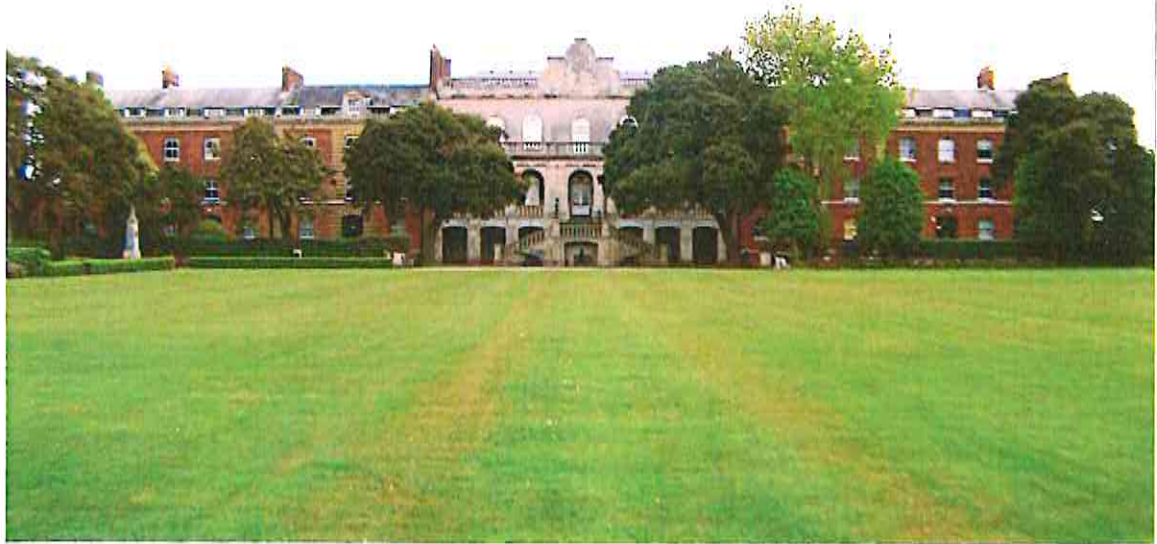
The Royal Marines Museum Main front, west elevation & grounds