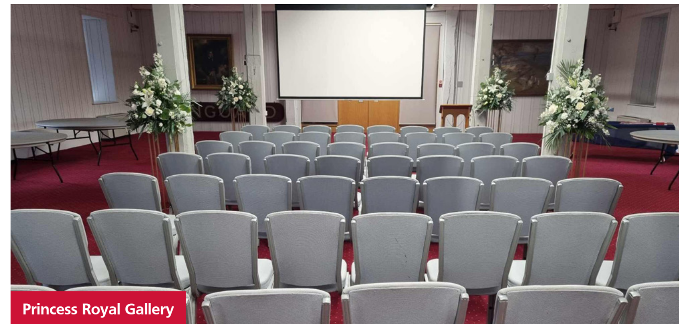
Princess Royal Gallery