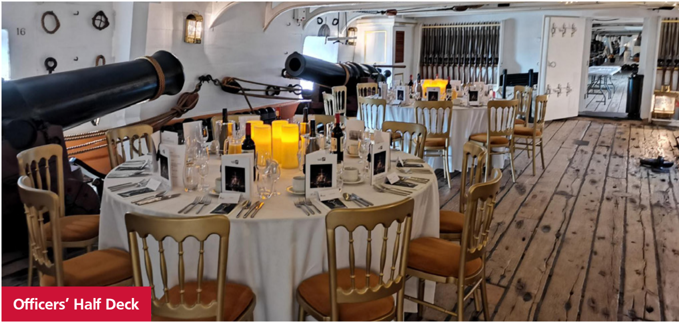
Officers' Half Deck