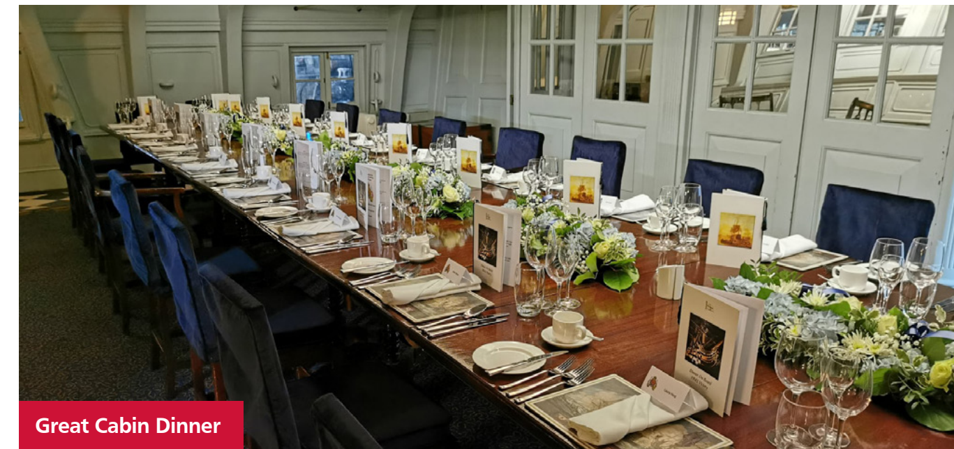
Great Cabin Dinner